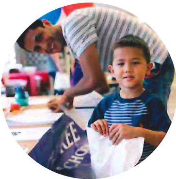
Kids in Need